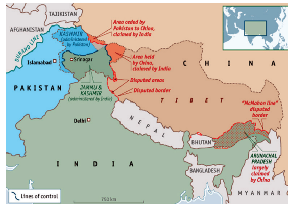
Fig. 2: Neighbouring Countries

Sri Lanka: Sri Lanka and India also sometimes had to sit to resolve the problem of border issue on the Kachchatheevu Disputed areas could be seen in the following map.